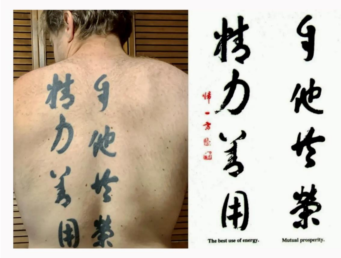
Seiryoku Zenyo 自他共榮 and Jita Kyozei 自他共榮