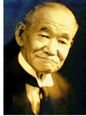
Jigoro Kano, Judo's Founder

Judo is a way to effectively use both your physical and spiritual strength. By training you in attacks and defenses, it refines your body and your soul, and helps you make the spiritual essence of judo a part of your very being. In this way, you are able to strive toward self-perfection and contribute something of value to the world.