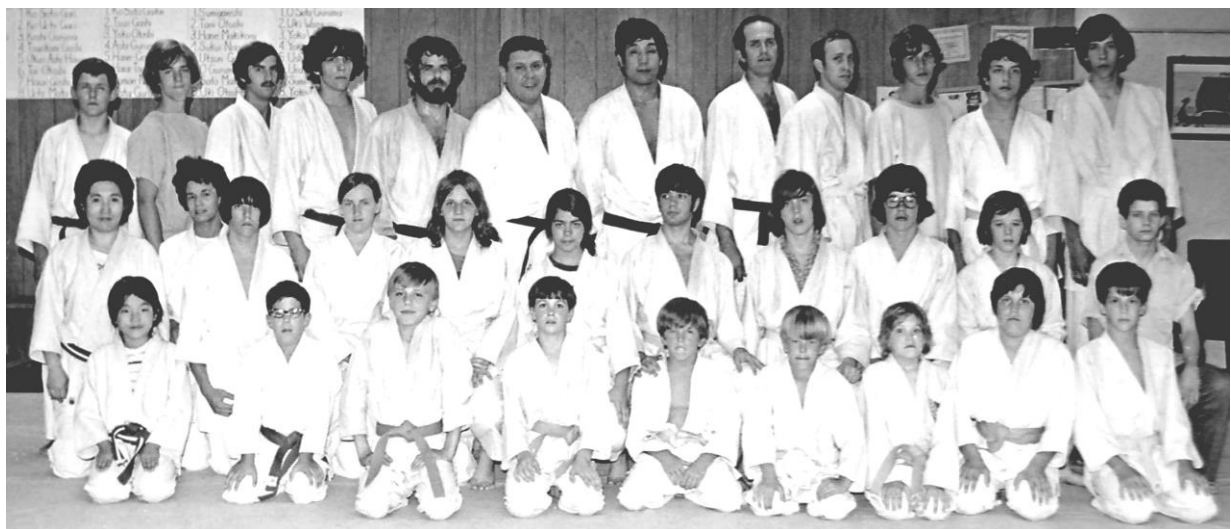
Kim's Judo School 1970